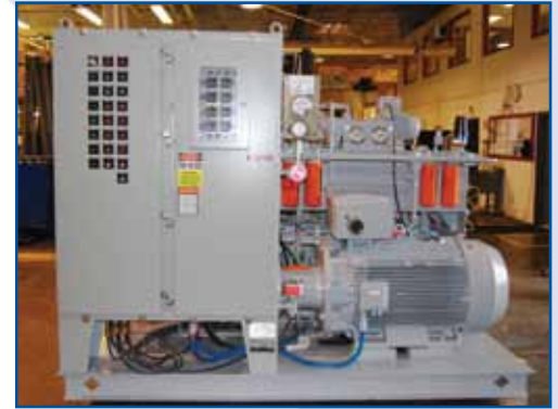
Custom Power Units