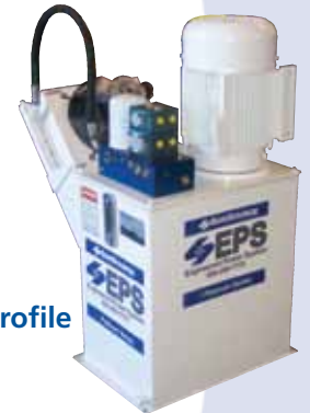
Vertical EPS Profile