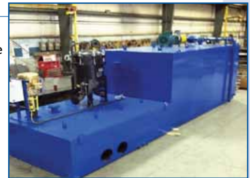
Custom Coolant Systems

Hydraulics • Pneumatics • Automation • Lubrication • Filtration • Coolant Systems • Service & Repair